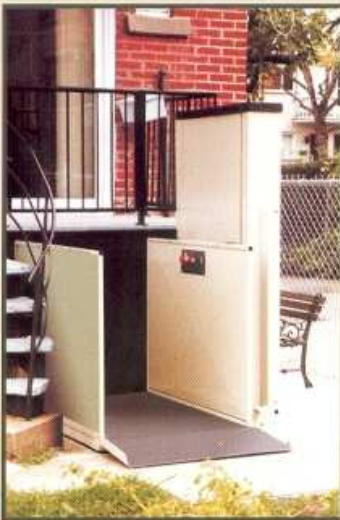
WHEEL CHAIR / PLATFORM LIFT